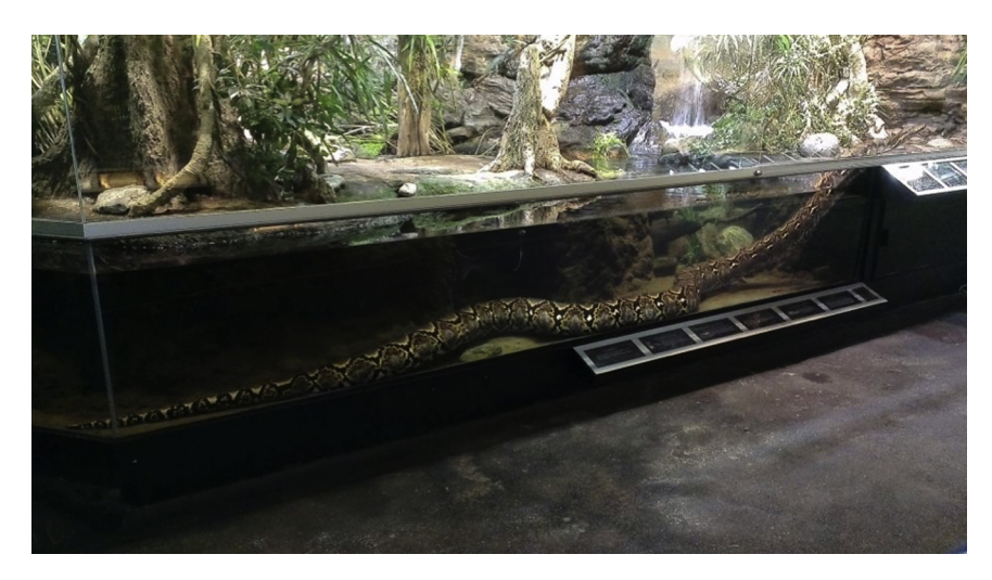
Figure 1. Aquatic rectilinear motion: python (Python sp.) in zoological conditions.

Common justifications for spatially minimalistic enclosures and husbandry practices involving snakes in general are based on a number of beliefs, including that snakes are sedentary, insecure in large environments, do not use space, suffer from agoraphobia (anxiety related to open spaces) and anorexia, and further that snakes thrive in small spaces, and feed, grow, and reproduce well (for example, Bartlett & Bartlett, 1999; Engler, 2010; Iherp, 2011; McCurley, 2005; Pets4Homes, 2018; Reddit, 2015; TBC, 2018). However, these views are not universal among herpetologists, herpetoculturalists, and other snake keepers (for example, Mendyk, 2018; Rose et al., 2014; Silvestre, 2014).