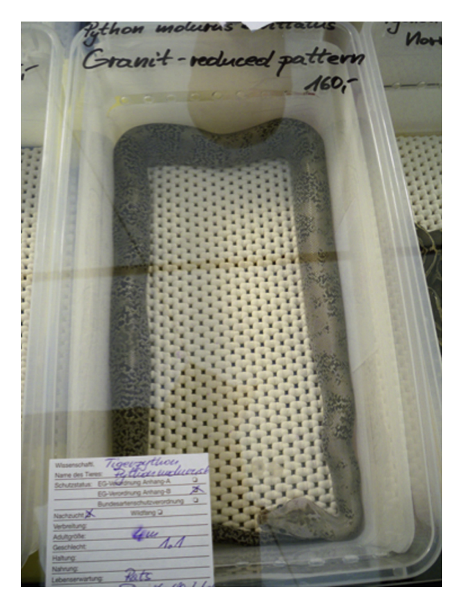
Figure 4. Attempted rectilinear motion: python ( Python sp.) in pet 'fair', 'expo' 'market' conditions.

reproductive exhaustion or obesity, and thus these factors are not reliable indicators of good welfare.