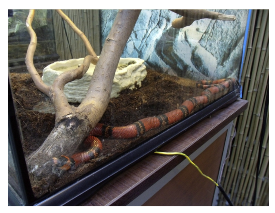
Figure 2. Terrestrial near rectilinear motion: milk snake (Lampropeltis sp.) in hobbyist/private conditions.

Claims regarding sedentarism and spatial insecurity are poorly considered by many keepers. For example, in highly exposed areas, many species will naturally utilize local cover during locomotion or seclude themselves in small or tight refuges at rest, but such behavior constitutes only part of overall activity budgets (Gillinghan, 1995; Mendyk, 2018). Agoraphobia is a human anxiety condition and not recognized in snakes (Warwick, et al., 2013). Extensive natural home ranges, as outlined previously, dismiss notions that snakes do not use space. Indeed, were snakes truly both sedentary and agoraphobic then keepers would require no vivaria frontage or lids and could open all enclosures confident that snakes would not leave the proposed security of their cages. However, snakes