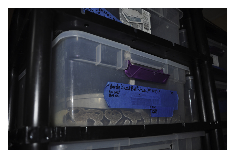
Figure 6. Close view of a racking system enclosure showing a Royal ('ball') python (Python regius) under minimalistic spatial and other provisions.

attract legal consequences (Warwick et al., 2017). Therefore, between possible misinterpretation of numerous behavioral and physical signs and particular transparency concerns, it may be appropriate to regard overly positive anecdotal reports relating to snake welfare in diminutive enclosures and racking systems with a degree of circumspection. Accordingly, the lack of reliable information from the commercial and private sectors may represent serious under-reporting of minor and major problematic issues associated with truth telling surrounding sensitive topics (Moorhouse et al., 2017; Warwick et al., 2017). Figures 5–7 provide examples of a racking system.