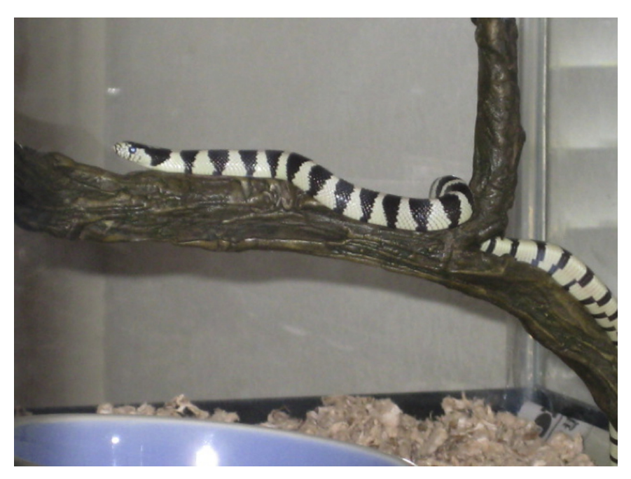
Figure 3. Concertina motion: kingsnake (Lampropeltis sp.) in hobbyist/private conditions.

Regular feeding and breeding is frequently also reported in association with captivity-stress where energy may be redirected toward basic biological functions (Warwick, 1990a,b, 1995; Broom & Johnson, 1993; Moore & Jessop, 2003), which may result in