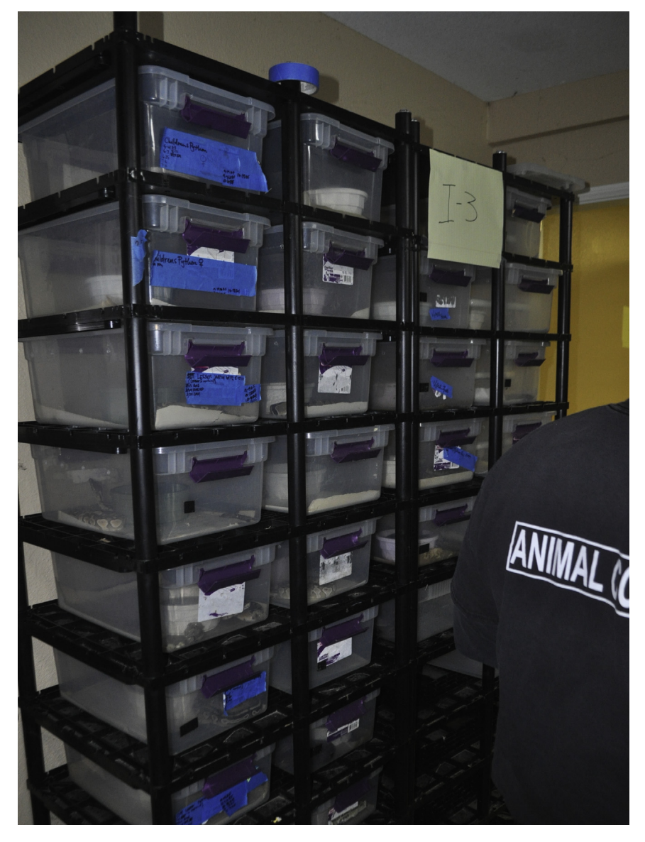
Figure 5. Example of a racking system in which many snakes are commonly confined.

Snakes are known to manifest a wide range of behavioral and morbidity problems related to their captive conditions and husbandry, many of which are very common and persistent (Frye, 1991, 2016; Homer, 2006; Mader, 2006; Oonincx & van Leeuwen, 2017; Pilny, 2015; Warwick, et al., 1995; Whitehead, 2018; Wilkinson, 2015). Objective scientific studies reveal high mortality rates among captive reptiles (including snakes), for example, 41% at 10 days relating to the commercial sector (Ashley et al., 2014) and 75% annually in the private home (Toland et al., 2012). Prevalence and specificity of behavioral and physical problems, morbidities, and mortalities related to overly restrictive enclosures are generally unavailable in documented form. For many if not most commercial and other breeders or producers of snakes, documentation of serious welfare issues or captivity-related disease, injury or death may both equate to an admission of management failure and also